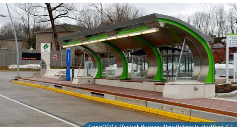
ConnDOT CTfastrak Busway, New Britain to Hartford, CT