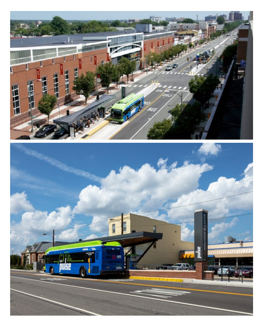
Images on this spread and on the cover: VDOT GRTC The Pulse BRT Design-Build, Richmond, VA

Founded more than 100 years ago, STV is quality-driven, client-focused, and has a vision for the future.