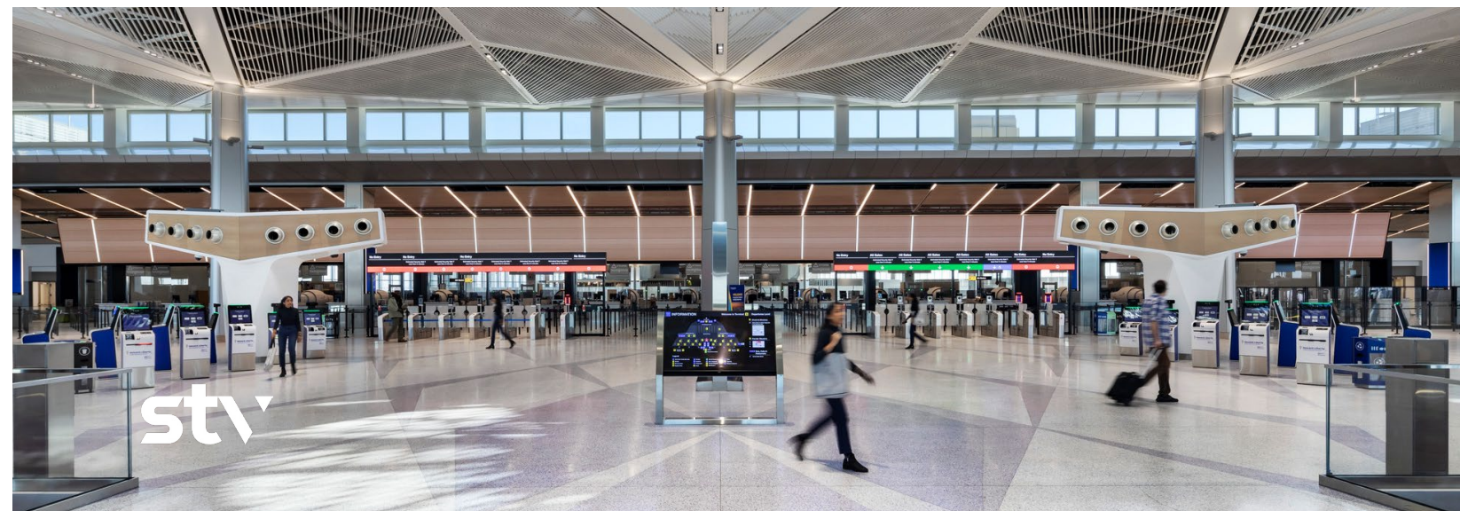
Newark Liberty International Airport Terminal A Redevelopment, for which STV served as Architect and Engineer of Record, is pending LEED Silver Certification.

We have a responsibility to keep clients informed of SE 2050 and other emerging sustainable design initiatives, and to make embodied carbon reduction strategies accessible through effective communication. Our team will leverage our avenues for communication (e.g. external presentations, industry events, our online presence, and visualization tools), engage our partners in dialogue around embodied carbon reduction strategies, and identify feasible pathways to achieve decarbonization goals.