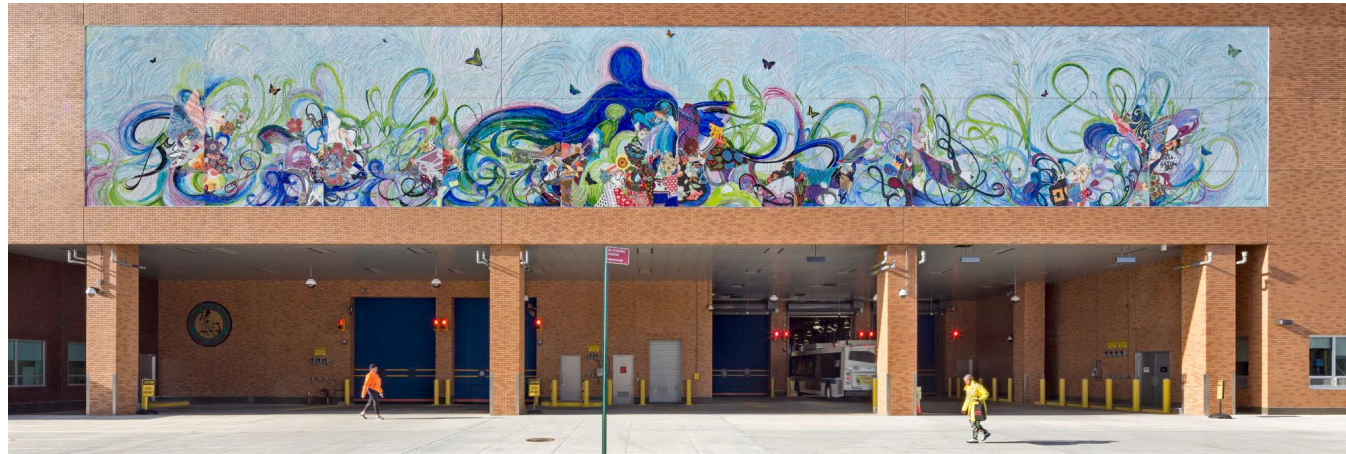
STV provided architectural and engineering services for New York City Transit's Mother Clara Hale Bus Depot. The LEED Gold-certified facility features low-emission boilers, heat-recovery air handling units, natural lighting, rainwater recycling, solar air pre-heating, and a green roof.

STV teams are critically evaluating our project workflow to embed embodied carbon reduction within our design DNA. Our approach for integrating reduction strategies includes the following steps.